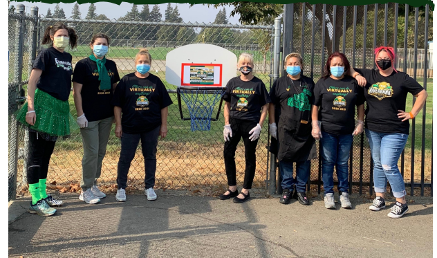
This month we celebrate our amazing Cafeteria Staff!